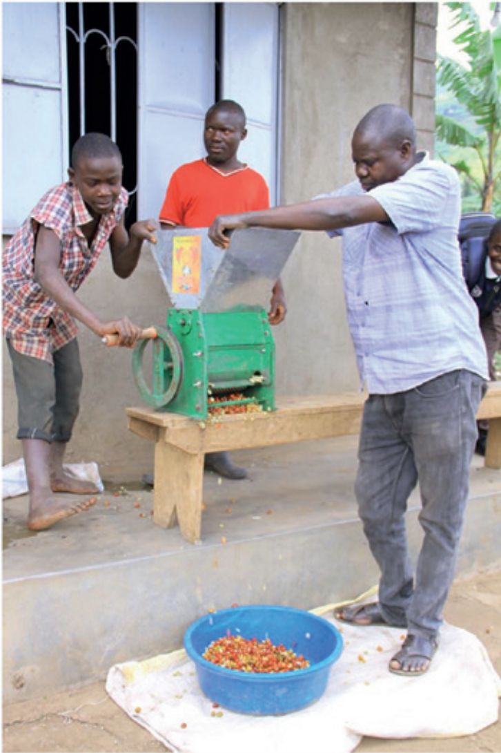
The Project Coordinator demonstrating the use of a manual coffee pulper.