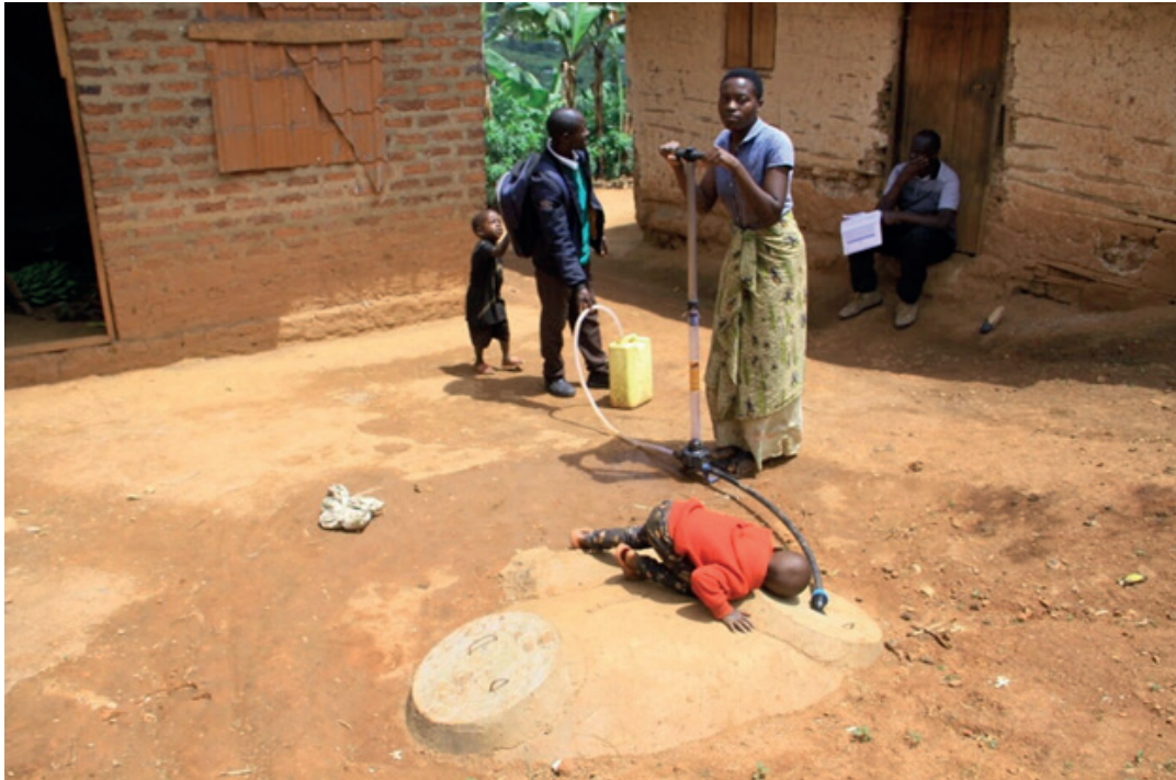
The project beneficiary pumping water from the underground tank.

As a result of building rainwater collection infrastructure for better coffee processing undertaken by Nyabuswa Coffee Farmers Association (NCOFA):